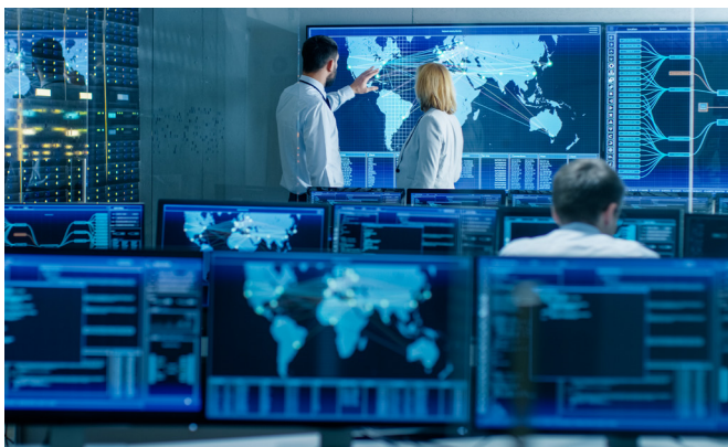
VIDEO WALL CONTROL & KVM